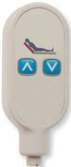
Series 7 Plus 2 Button