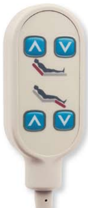
Series 7 Plus 4 Button